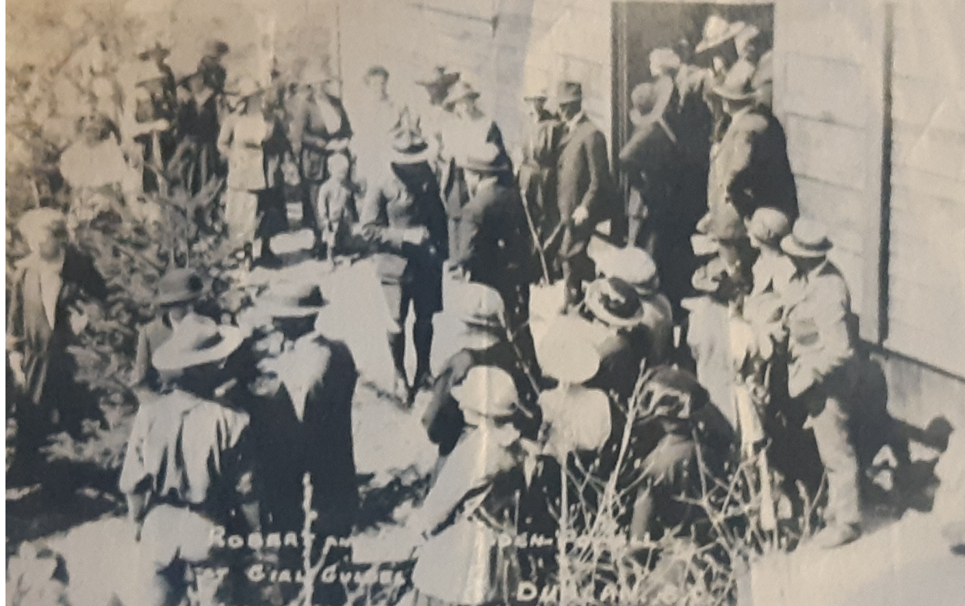
The Official Opening April 25th, 1923