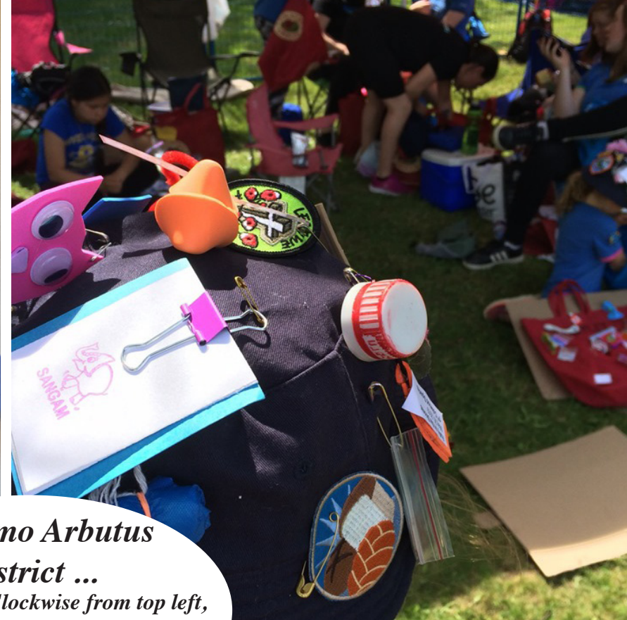
Nanaimo Arbutus District ... always busy!! Clockwise from top left, working on Ocean Aware, hat traders, having fun, and Sparks being Sparks