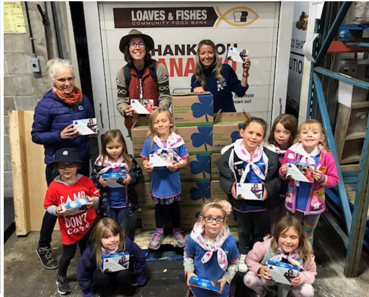
Cedar Sparks had an anonymous community member buy 19 cases of cookies then turn around and asked if we could donate them to the local food bank!

We had a meeting at the food bank for the girls to learn more about what happened there and what services were offered. It was amazing.