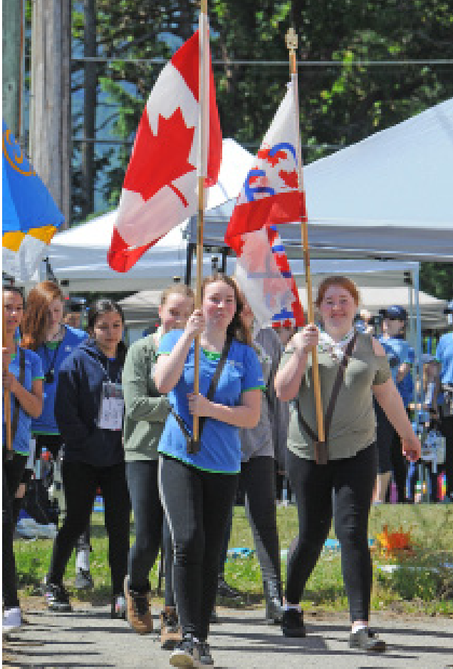
The colour party marches in the Canadian flag, Canadian Girl Guides flag and the world flag.