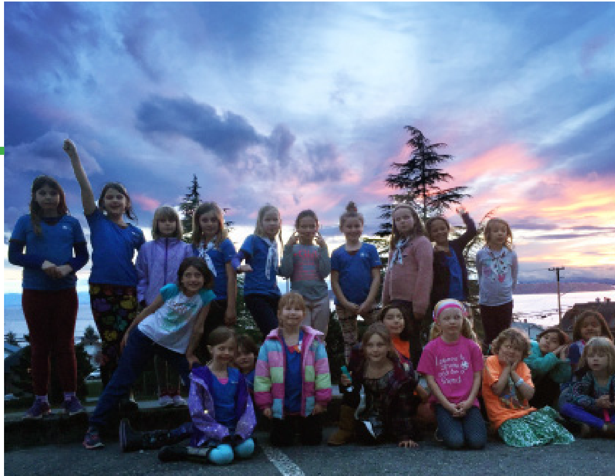
Photo right, 1st Powell River Brownies, 2nd Powell River Sparks and Kelly Creek Multigroup Sparks and Brownies during our Celebrations Around the World Sleepover.