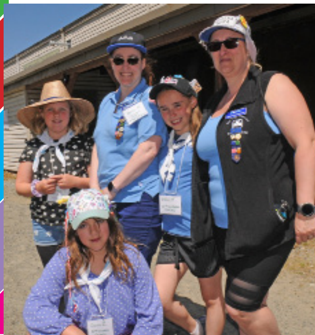
“Hey, do you mind taking a photo of our group?” The 14th Victoria Guides gather for a group photo before moving on to some of the activities at Rally on the Shores.