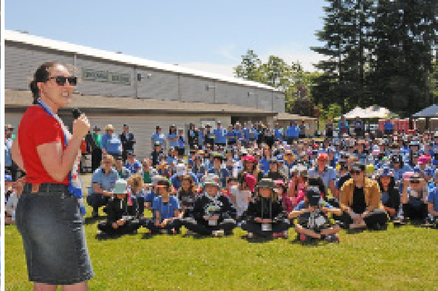
British Columbia's newest provincial commissioner, Diamond Isinger, revs up nearly 1,500 rally participants with her opening speech.