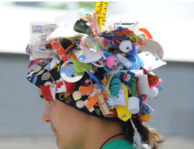
Traders were serious business at the rally; hats such as this one could be seen throughout the site.