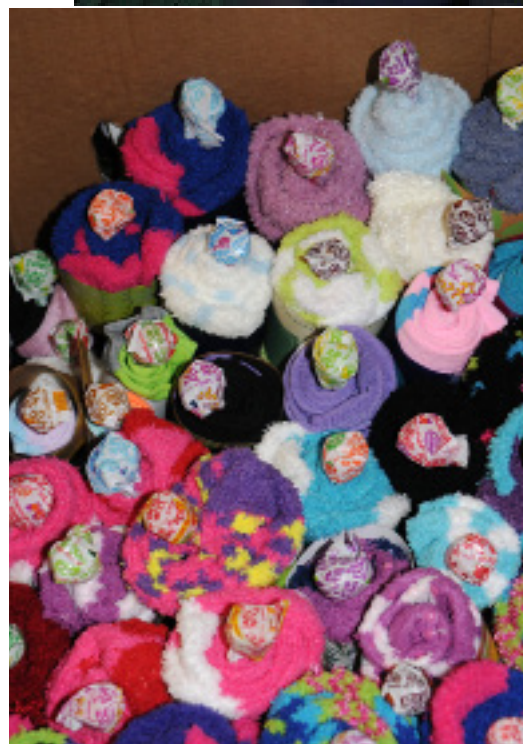
Rally participants created “sock cupcakes” as a giant service project. The socks are being distributed to organizations that will give them to people who need them most.