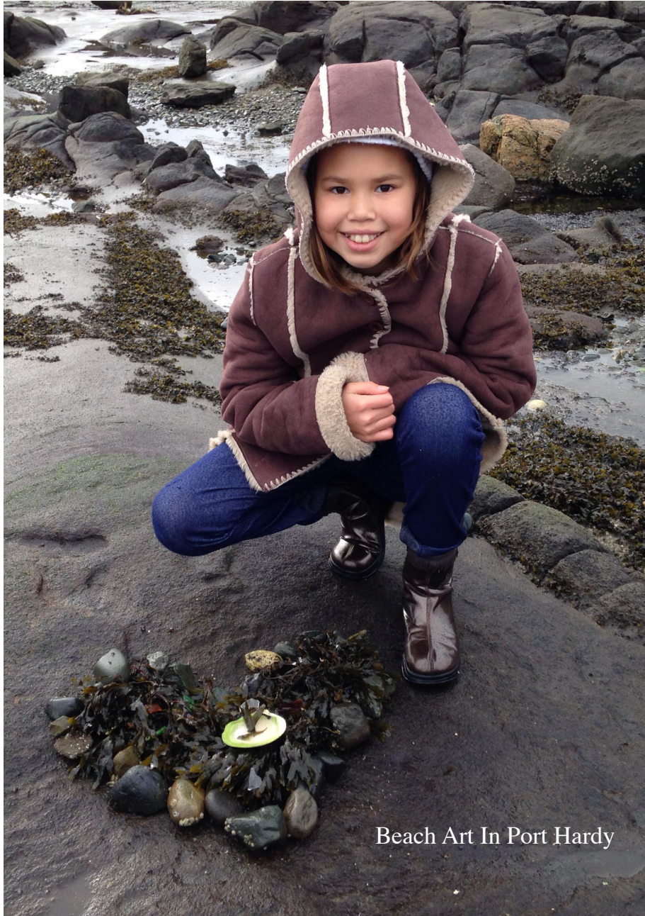
Beach Art In Port Hardy

Port Hardy Guides had a World Centres camp held at the North Coast Trail Backpackers where they earned the BC World Centres Crests, learned about Hosteling, met some German hostellers and also went to the beach to do some Land Art. At Halloween the Guides organized a party for our joint Sparks and Brownie unit. They baked goodies, made invitations and decorations and planned the games.