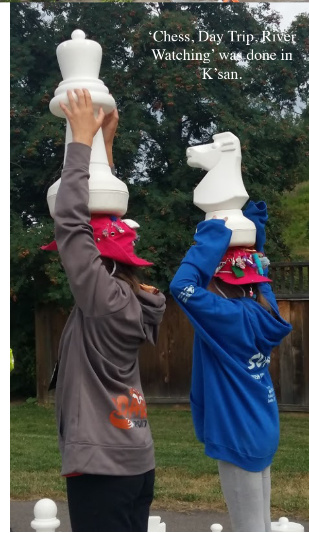
'Chess, Day Trip, River Watching' was done in K'san.