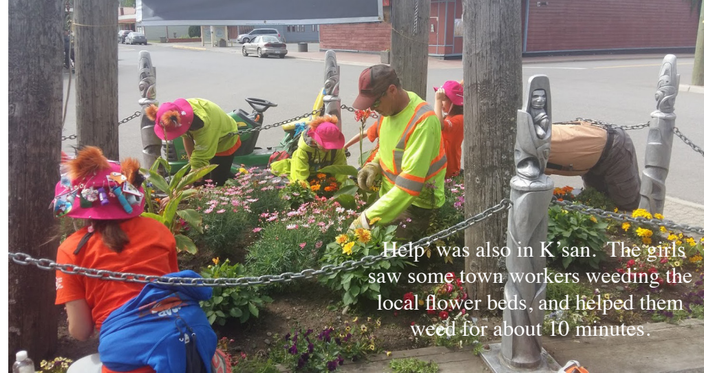
Help' was also in K'san. The girls saw some town workers weeding the local flower beds, and helped them weed for about 10 minutes.

'HM19' 7 Guides from 1st Cowichan Guides, and 1 Pathfinder from Bench Pathfinders.