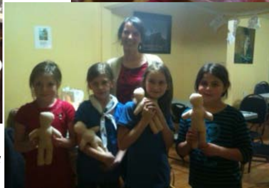
The girls made Medical Dolls for the hospital.