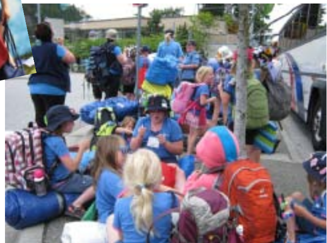
Blowing bubbles, having fun, but thank goodnes for duct tape!