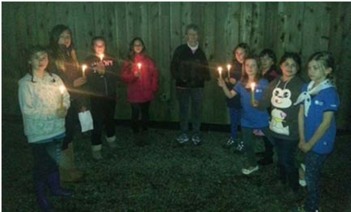
Wellington Pathfinders and Gabriola Guides got together for a Thinking Day Ceremony. The Guides made Thankyou cards for the Pathfinders.