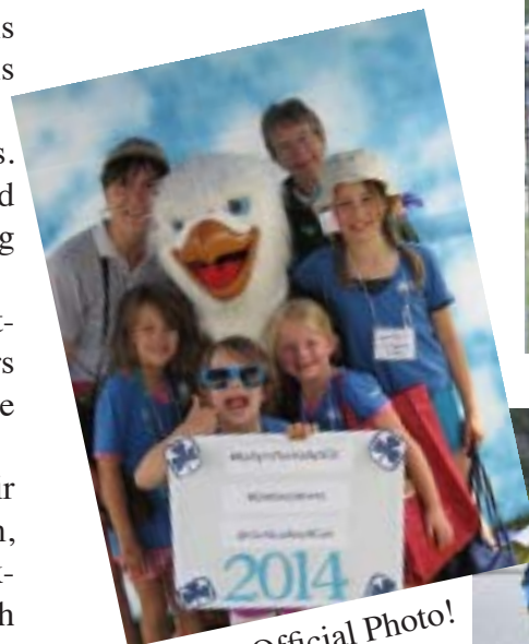
The Official Photo!